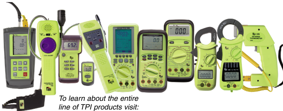
To learn about the entire line of TPI products visit:

Longley House, East Park Crawley, West Sussex RH10 6AP England Tel: +44 (0)1293 561212 Fax: +44 (0)1293813465 contactus@tpieurope.com