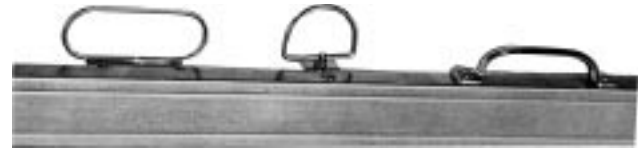
BAILHANDLES stock #1007

HANDLES - Three types of handles are available, at an additional cost. Bail, Lock-type and Rigid handles facilitate filter removal and installation.