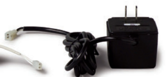
IN-10 UV: EV9100-79