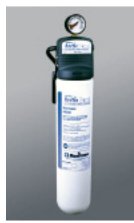
AR-PRE Pre-filter, dirt and rust sediment reduction