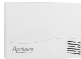
Model 8062 Optional Remote Humidity Sensor