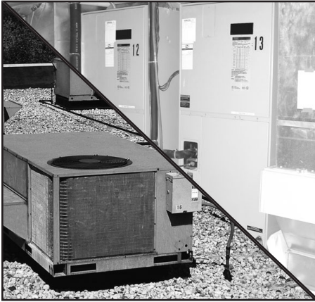
HVAC Equipment Split System