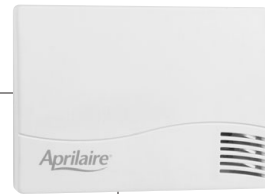
Model 8061 Optional Remote Temperature Sensor