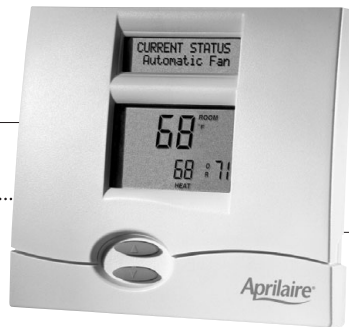
Model 8870 Aprilaire® Communicating Thermostats