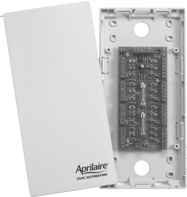
Model 8818 Distribution Panel

Temporary connection LAN or Phone TCP/IP protocol