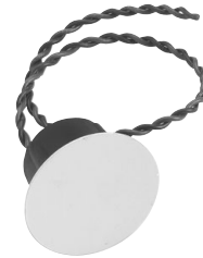
Model 8051 Optional Flush Mount Temperature Sensor