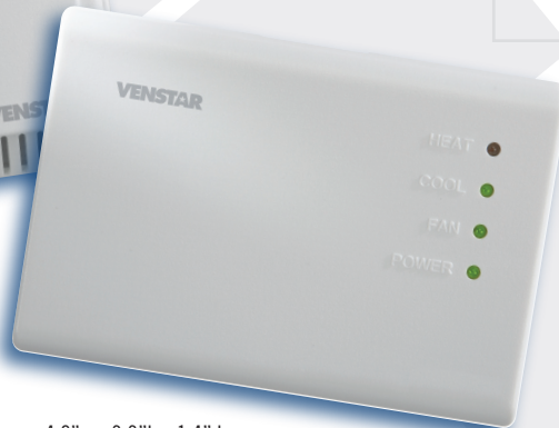
4.9" w x 3.3" h x 1.4" d