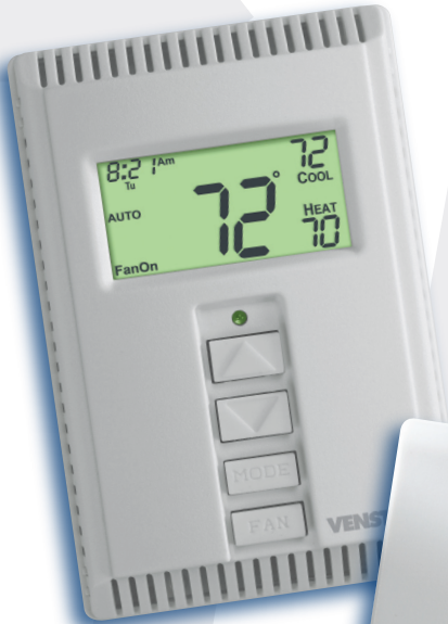
3.3" w x 4.9" h x 1.4" d