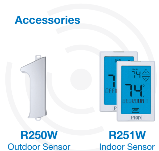
R250W Outdoor Sensor