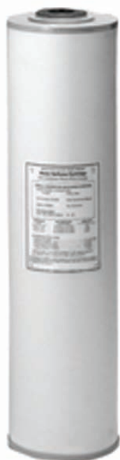
SO-10 Softening Cartridge: DEV9105-41