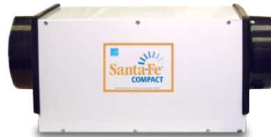
Santa Fe Compact shown with 2 duct kits attached.

You can duct your Santa Fe Compact from a utility room into your basement with this Duct Kit.