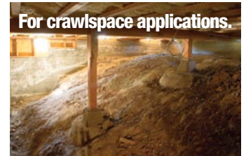
For crawlspace applications.