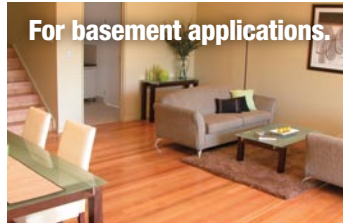
For basement applications.

Easily move the Santa Fe from one end of your basement to the other with this easy-to-install Caster Kit.