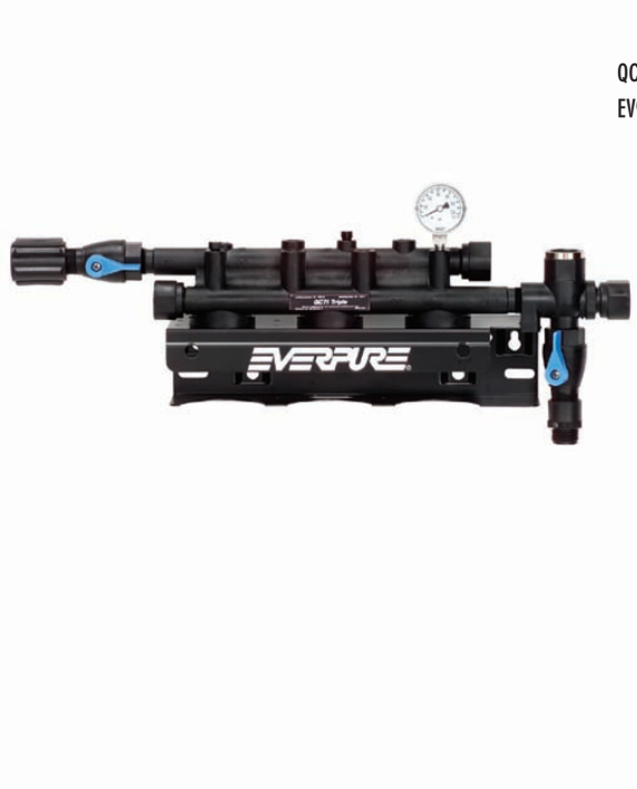
QC71 Triple Parallel Head: EV9272-23

Filter head exclusively for Everpure replacement cartridges