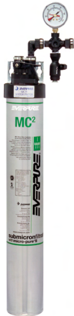
QC7I Single-MC 2 System: EV9275-01

Delivers premium quality water for fountain applications