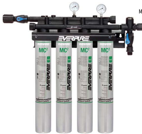
QC7I Quad-MC 2 System: EV9337-11

Delivers premium quality water for fountain applications