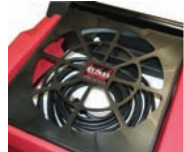
Convenient storage for power cord and drain hose.

The R200 marks Phoenix Restoration Equipment's second entry into the manufacturing of rotomold LGR dehumidifiers, proving our commitment to technology, performance and durability.