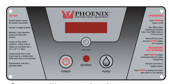
Easy to use solid state control panel.

In addition to the performance benefits and compact size, the R200 has patented bypass technology for higher temperature operation, increased airflow to 325 CFM, multiple ducting options, R-410A refrigerant, and impressive air filtration with a pleated media MERV-11 filter. The R200 is the latest member of the Phoenix line of LGR dehumidifiers; the most effective and versatile drying devices made.