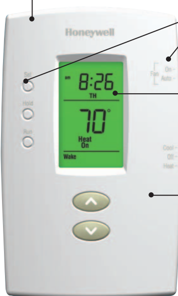
PRO 2000 Programmable

Simple-Set Programming – Basic operation makes it easy to set the heat, cool, fan and program schedules that fit your customers' lifestyle. Simplicity helps to reduce callbacks.