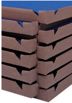
The space saving notched corner feature of a monobond frame

When compared to traditional designs, the Monobond type filter's notched frame corners allow units to interlock providing up to 33% savings on warehouse space and freight costs.