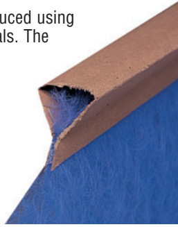
Cut-away of the Facet Monobond frame construction feature - 2" size depicted here.

Both the F312 and 2F frames are produced using 100% recycled post consumer materials. The unique Monobond concept involves a one-piece frame sealed to the media under heat and pressure. This construction feature produces a continuous bond of media to board around the periphery of the frame eliminating weak corners and air bypass. The use of a high tensile strength polyethylene binder increases the integrity of the seal, allowing the filter to withstand varying temperatures and humidity levels.