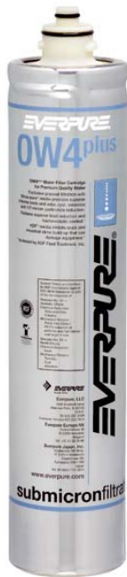
OW4-Plus Replacement Cartridge: EV9635-01

Delivers premium quality drinking water for bottleless coolers and drinking fountains