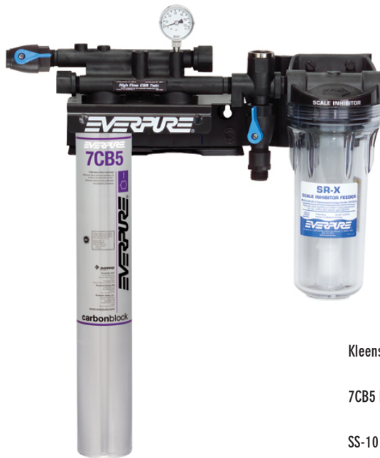
Kleensteam II Single System: EV9797-21

Everpure's second generation of total water treatment system for steam applications