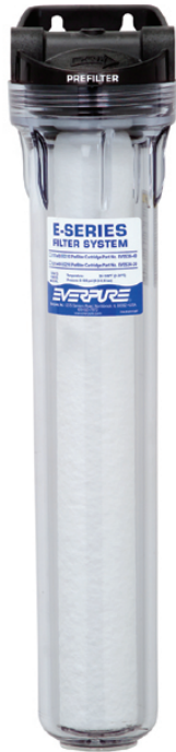
E-20 Prefilter System: EV9795-90

Prefilter System for foodservice applications