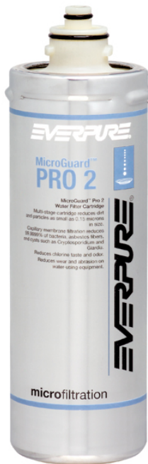
MicroGuard™ Pro 2 Replacement Cartridge: EV9637-01

Delivers premium quality drinking water for bottleless coolers and drinking fountains