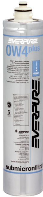
OW4-Plus Replacement Cartridge: EV9635-01

Delivers premium quality drinking water for bottleless coolers and drinking fountains