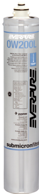
OW200L Replacement Cartridge: EV9619-01

Delivers premium quality drinking water for bottleless coolers and drinking fountains