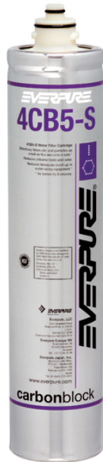
4CB5-S Replacement Cartridge: EV9617-21

Delivers quality water for foodservice, vending and OCS applications