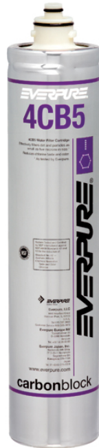
4CB5 Replacement Cartridge: EV9617-11

Delivers quality water for foodservice, vending and OCS applications