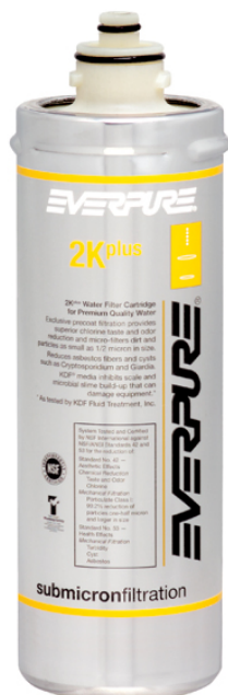
2K-Plus Replacement Cartridge: EV9612-61

Delivers premium quality water for foodservice, vending and OCS applications