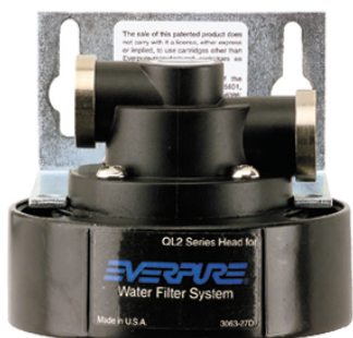
QL2 Single Head: EV9272-18

Filter head exclusively for Everpure replacement cartridges