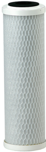
CG53-10S Replacement Cartridge: DEV9108-57