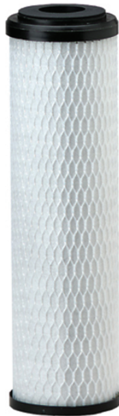
CG5-10S Replacement Cartridge: DEV9108-17