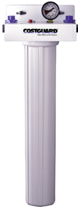
CGS-20 20" Single Housing: DEV9100-20