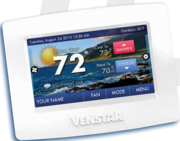
5.25" w x 4" h x 1.1" d