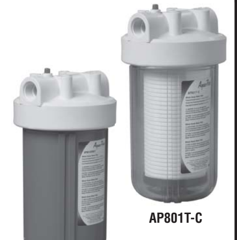
AP801 / AP801-C / AP801-1.5-C