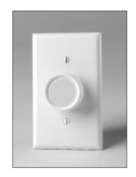
Cat. No. 6681